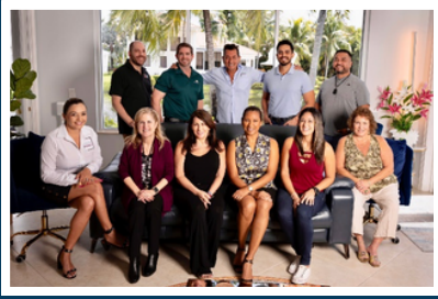
Plantation Chamber's Power Leads Meeting held at Davide De Pas Production Studio- September 2024