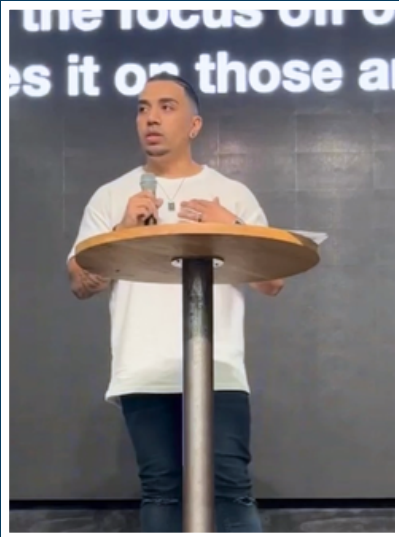
Internship sermon on Glory in Maturity at Northplace Church – August 2024